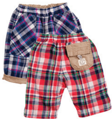
12 Reversible easy pants