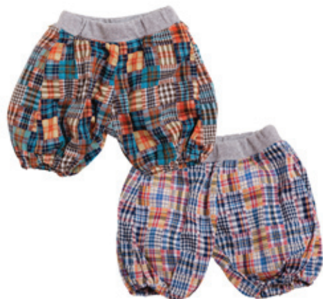
13 Baby balloon pants