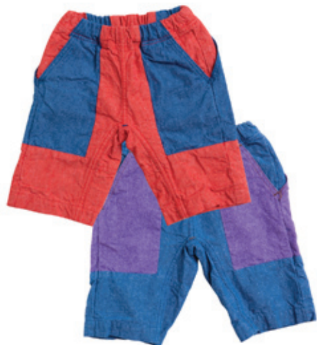
15 Mountain pants

12 No.05941 COLOR NAVY,AKA SIZE 80-XS(140cm) PRICE ¥6,195