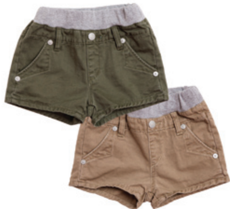
14 Short twill pants