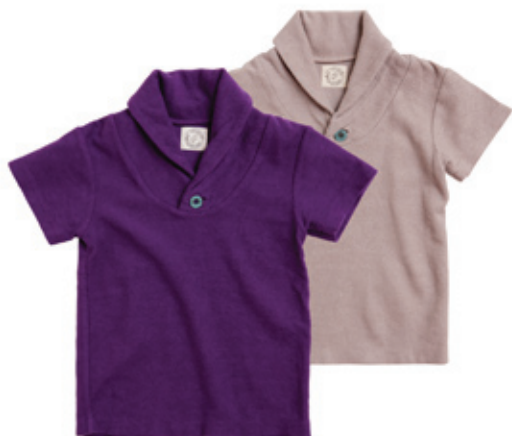
06 Shawl collar cutsew