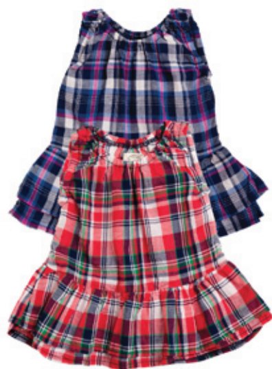
07 Baby mini onepiece