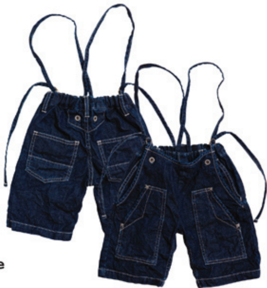
08 Hanger pants