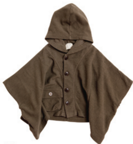
05 Poncho parka